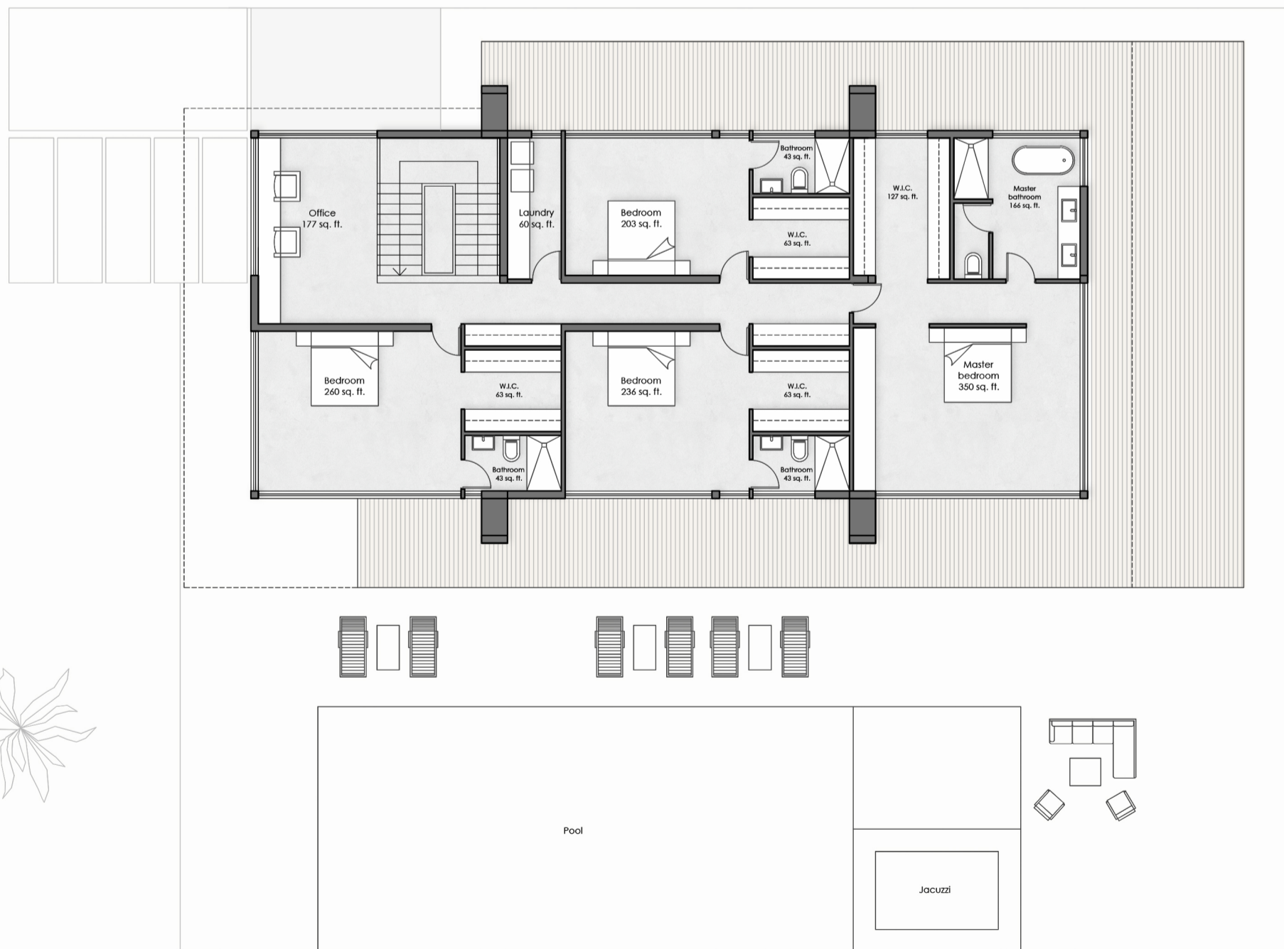
First Floor - 2300 sq. ft.